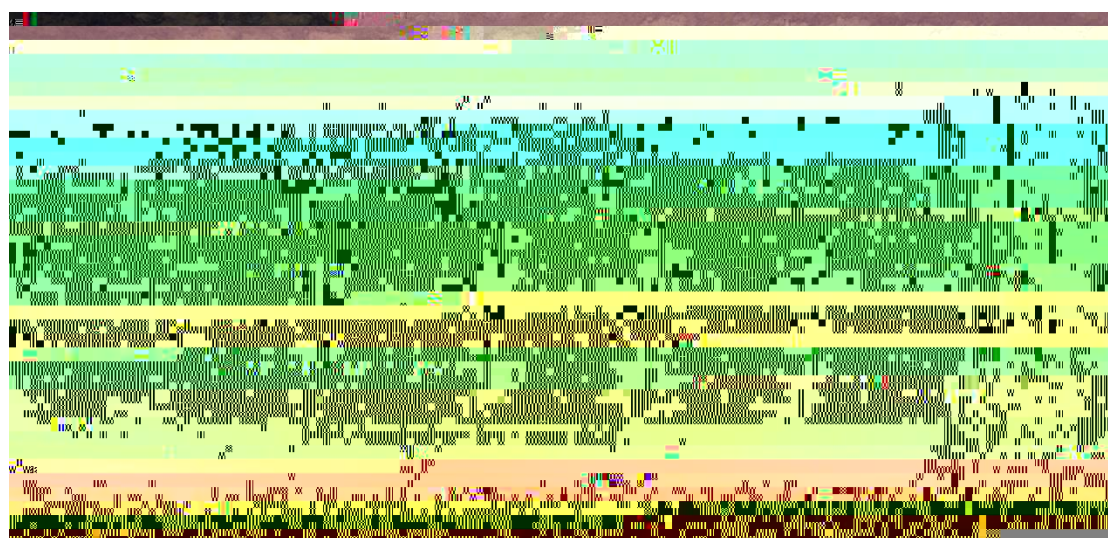
Second World War memorial Cloisters, New College, Oxford